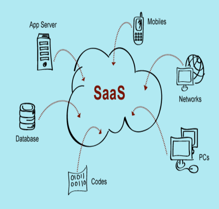
Fig 3: SAAS simple model