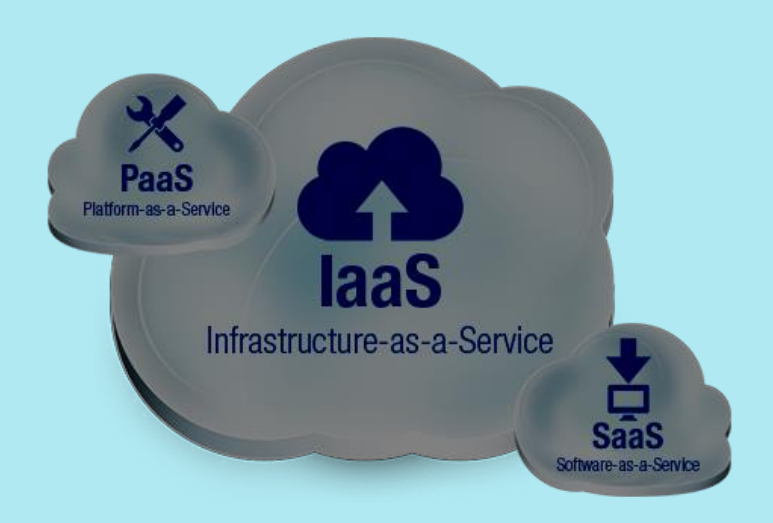
Fig 5: IAAS simple model