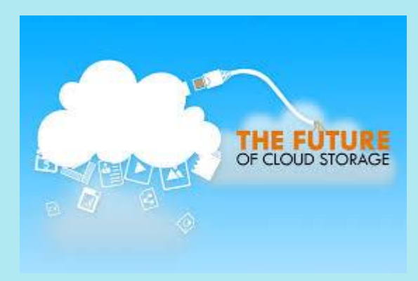
Fig 7: All Data Storing in Cloud

firm Zinnov Management Consulting estimates that the cloud computing market will grow from USD 400 million (currently) to USD 4.5 billion by 2015. A recent Microsoft- IDC study says that cloud computing will generate over 2 million jobs in India by 2015.