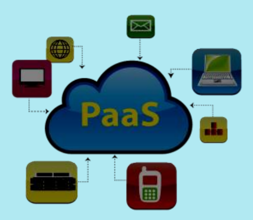
Fig 4: PAAS simple model