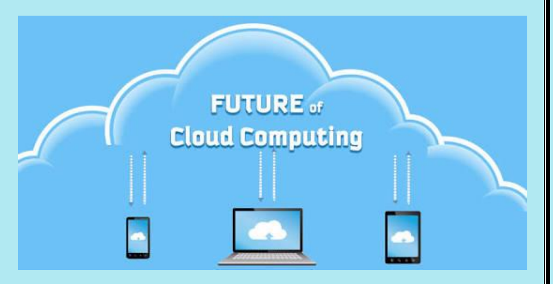
Fig 6: Future cloud using

As we all know, cloud computing has become an important part of our daily life. With the invention of this, the conventional view of computing has been changed. Due to the positive response of the users because of its user friendly and easy configuration techniques; the future of cloud computing seems very bright. From some organization's survey, it has been noted that in next decades 70% of Americans will use its various application for personal and official use. We all are aware of it because we all are using cloud computing in various forms like E- mail, accessing websites like Face book, Flicker etc. The future of cloud computing is becoming bright due to: the presence of High Speed internet becoming cloud computing more important. We are getting closer because the world has been globalised due to the internet facility through satellites. The internet is connecting people from one country to another within seconds through various cloud based websites like Skype, Whats App etc. Now, airlines are also offering satellite based services in flights. The cloud computing is becoming more robust than the other technologies. In future, the cloud computing systems will be validated through centralized trust. Centralized data is the future of cloud computing. This allows companies to create huge database. Due to this, projects can be managed in huge databases.